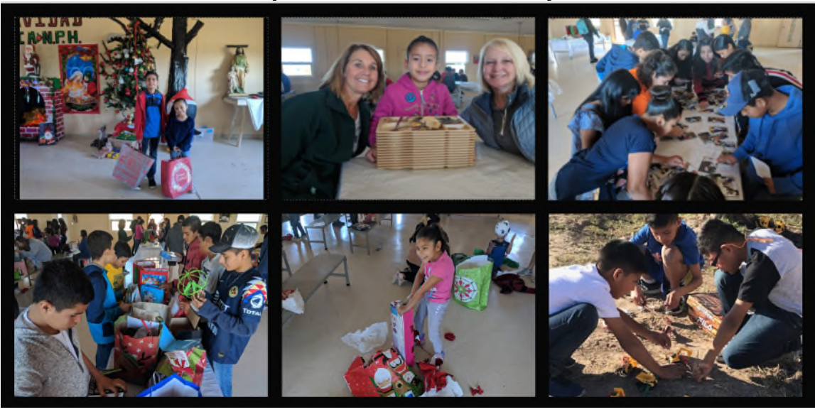
We Are Blessed As A Family