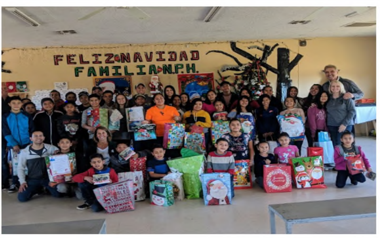
Our Special Celebration as a Family